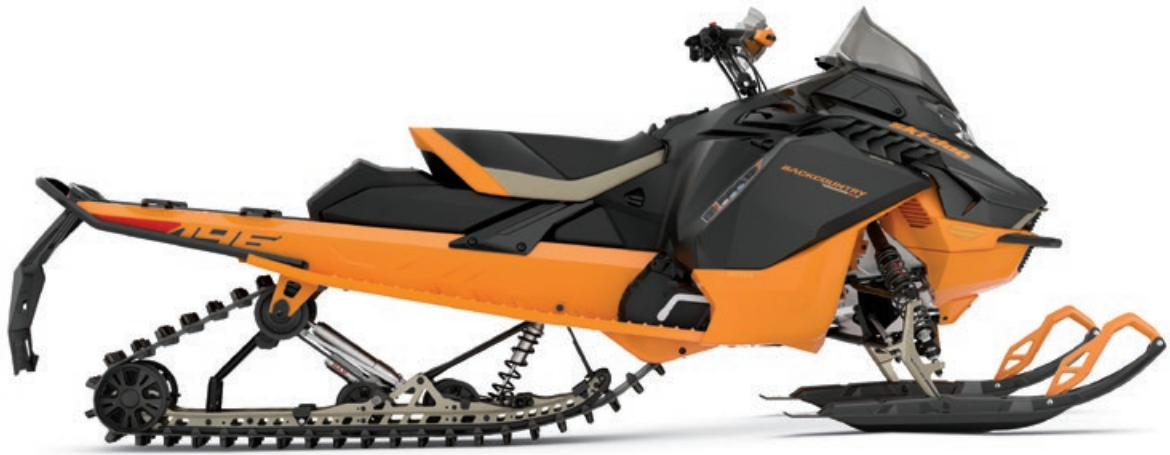
BACKCOUNTRY X 146 850 E-TEC SHOWN

The Backcountry™ X® equipped with the 43-inch-wide ski stance combined with RAS™ RX front suspension improves its on-trail cornering stability while maintaining traction and flotation in deeper snow.