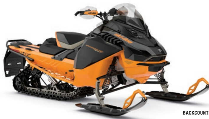
BACKCOUNTRY X 146 850 E-TEC SHOWN

A 50-50 sled with the most advanced technology, plus off-trail capability and rough-trail performance.