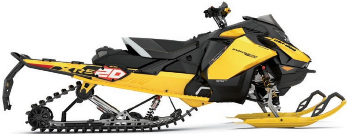
BACKCOUNTRY X-RS 146 850 E-TEC TURBO R SHOWN

The Backcountry™ X-RS® equipped with the 43-inch-wide ski stance combined with RAS™ RX front suspension improves its on-trail cornering stability while maintaining traction and flotation in deeper snow.